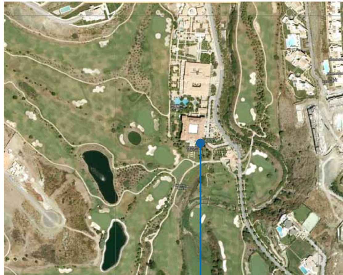
Hoyo19, Los Flamingos