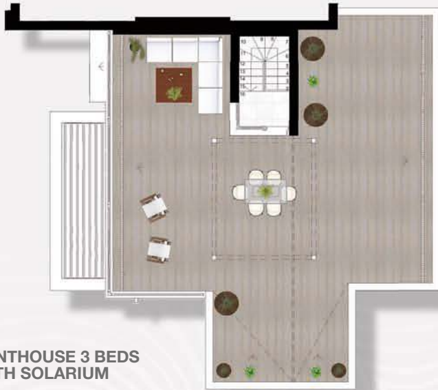
PENTHOUSE 3 BEDS WITH SOLARIUM