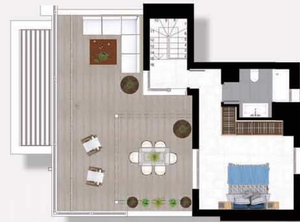
DUPLEX 3 BEDS WITH SOLARIUM